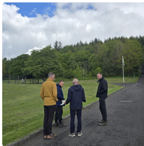
3. Green Flag Judging @PPC