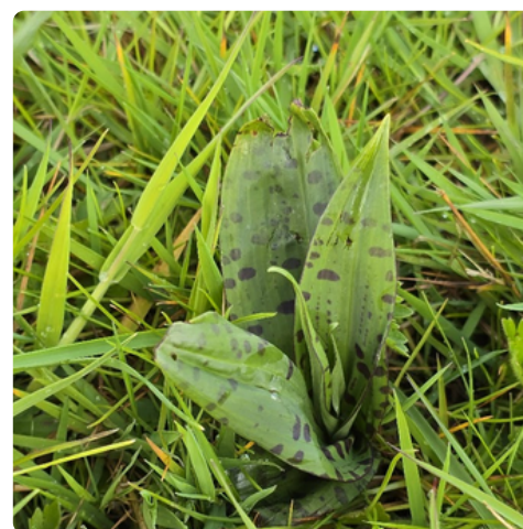
5. Common Spotted Orchids are coming up across our meadows!