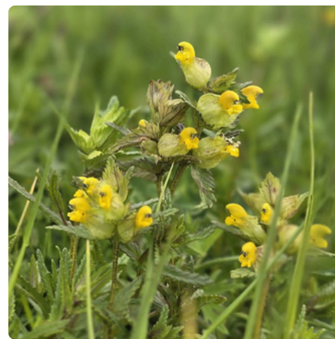
1. Yellow Rattle across all sites!