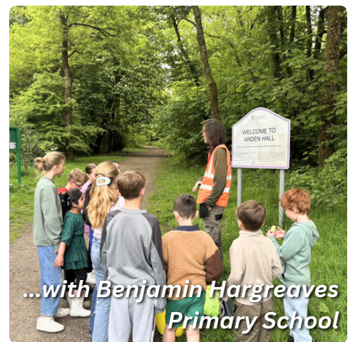
4. Seed Sowing/Scavenger Hunt