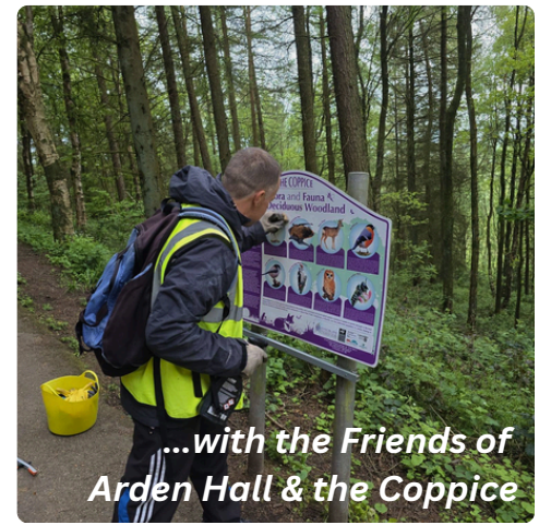
2. Site Tidy @PPC