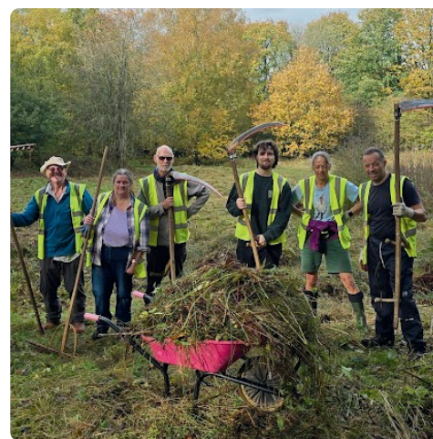
3. Scything at Plantation Rd @PPC