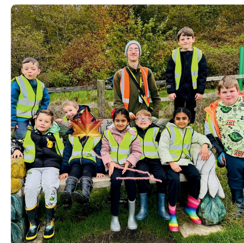
6. Woodland Scavenger Hunt and Rush Removal w/ Peel Park Primary Forest School!