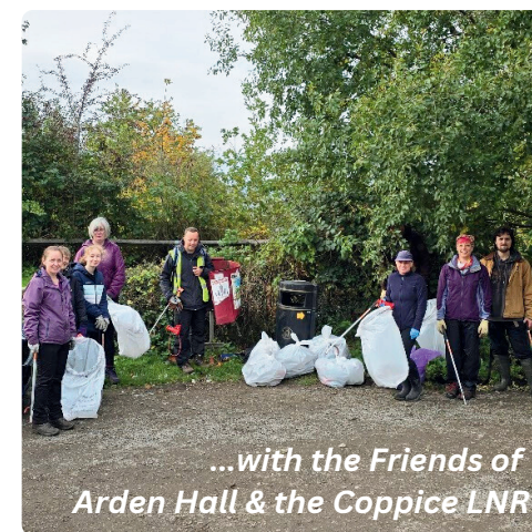
2. Coppice Litter Pick!