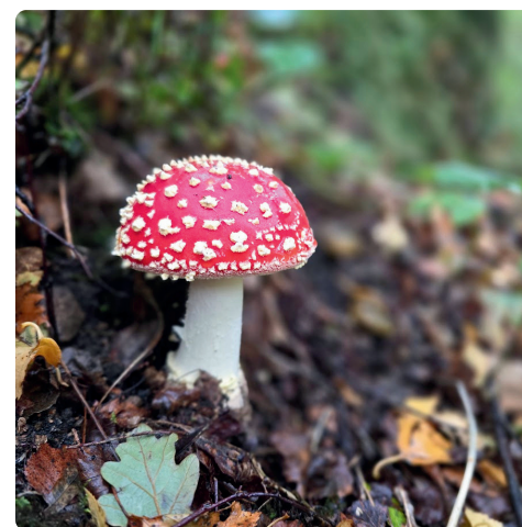
1. Fly Agaric mushroom

This year October was full of amazing autumn delights, a great year for acorns, mushrooms, berries and more! We finished up the last of our meadow work which resulted in a total of over 1.5ha of meadow cut and collected this year, about the size of two Accy Stanley football pitches! Thank you to the hard-working volunteers who have made that possible!