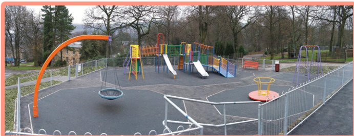
A large playground on two separate levels for a wide range of ages and abilities.