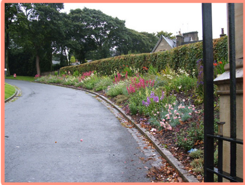
Floral displays found throughout the park.

is the main park of Accrington serving both the town and also the Borough of Hyndburn. Oak Hill Park is one of the largest parks in the Borough and has a range of features and facilities.