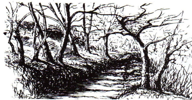
The Track to Dean Bridge

• Follow the track past Rodger Hey Farm on your right and down the path taking the stile on your left keeping the fence on your right and continue in a straight line to the next stile. The way is known as Long Fields. A stile leads you on to the farm track, turn left and in a further 250 yards you reach your starting point at Allsprings Lodge