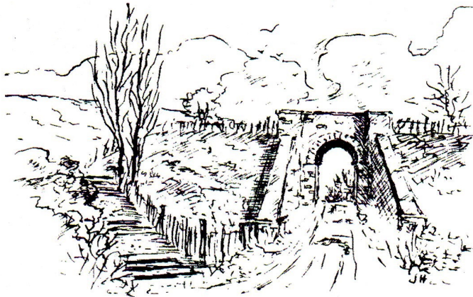
The Lane to Tottleworth