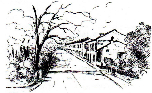
The Dog and Otter Inn