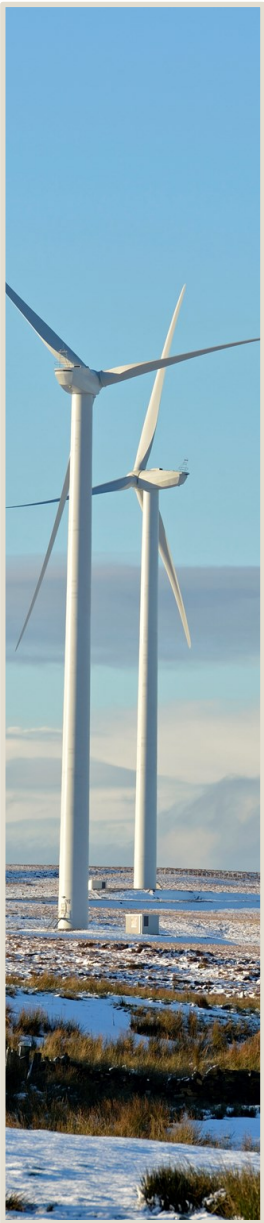
Two of the turbines on Oswaldtwistle Moor