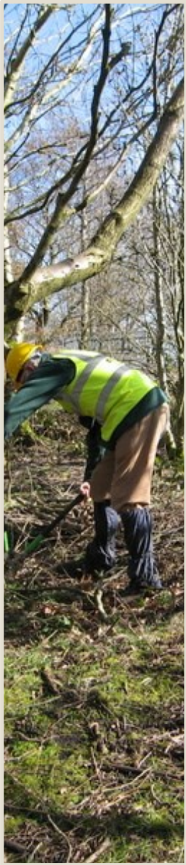
Volunteer at work coppicing the trees at Hollins Wood in Baxenden as part of the Monday Conservation Group activities

Growing Wild is a community group that has been given an allotment site on which they will be growing food and encouraging families to take part in Forest School activities. To help gauge interest and increase support for the project, the PROSPECTS Forest School practitioner carried out 7 parent and child sessions. These sessions showed parents and the Growing Wild group how they could make the most of the outdoors with their children and encouraged exploration and contact with nature. Activities have included stream dipping, bug hunting, fire building, den building and toasting marshmallows. The success of the sessions has helped Growing Wild to secure a grant from the Windfall Fund to enable them to become a more independent group with their own insurance and to set up more family Forest School events. It has also inspired one of the parents to set up a website and publicise the project to attract more volunteers.