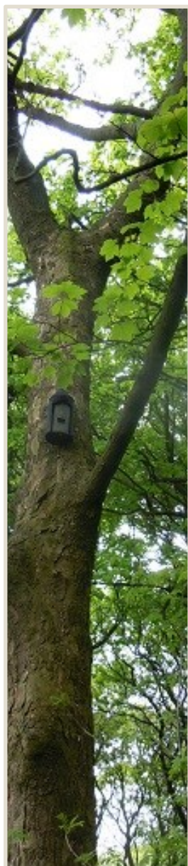
Bat box in Spout House Woodland installed after a bat walk organised through East Lancashire Bat Group

The year has ended on a high for the Rishton PROSPECTS Panel with a fascinating 'dawn chorus' walk around Cut Wood Park to listen to and