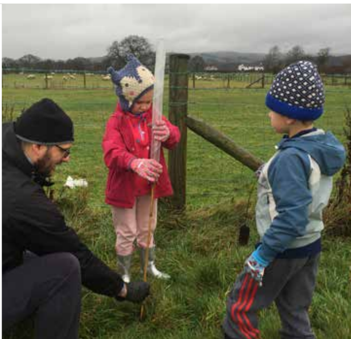
Tree planting at Great Harwood Rovers Football Club