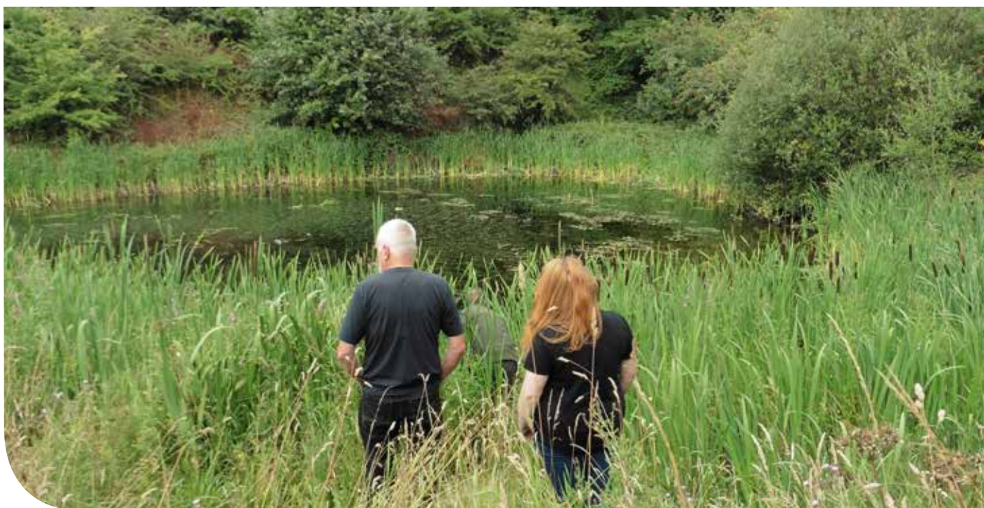
Pond survey training at Whinney Hill