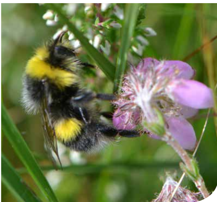
White-Tailed Bumblebee