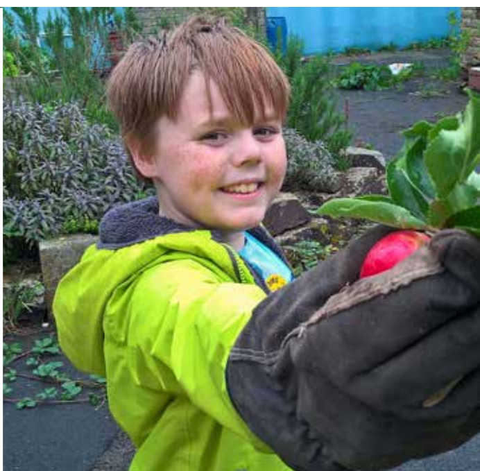
Young Carers planting some veg and enjoying some local produce as part of the Rewilding project