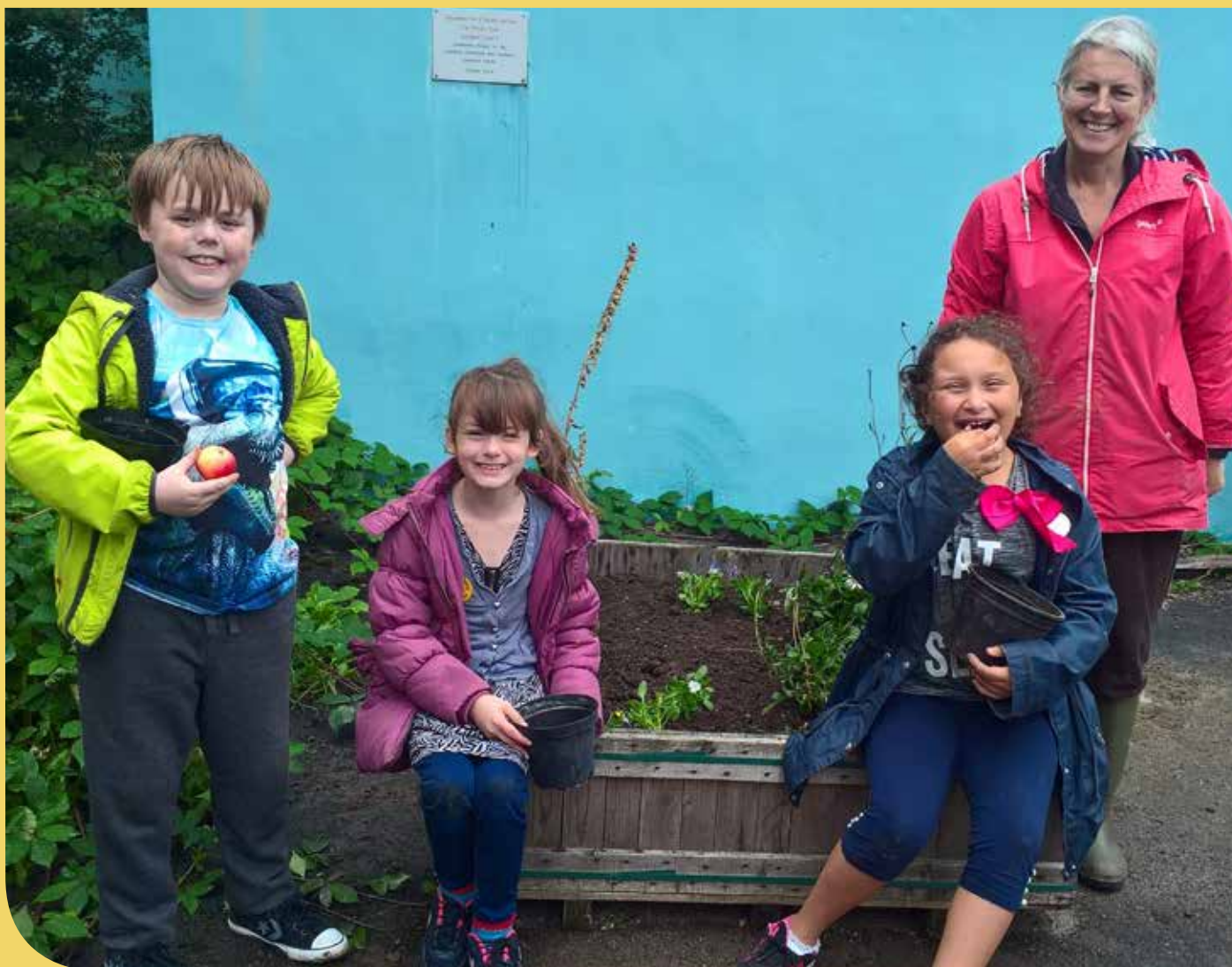
Young Carers at The Resource Centre Garden after planting and sowing wildflower seeds