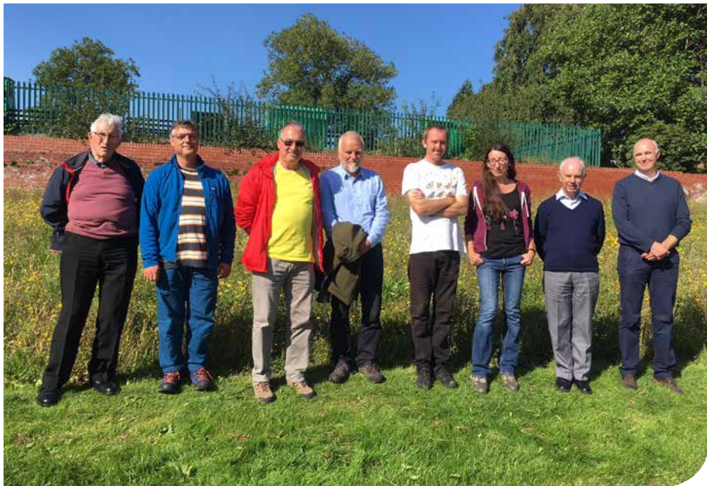
Trustees and EnergieKontor UK representative visiting the Hyndburn Butterfly Project at Milnshaw Park