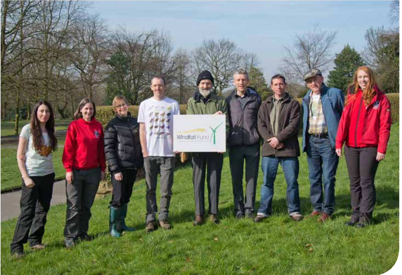
Windfall funding approved for the Hyndburn Butterfly Project

THE WINDFALL FUND is the community benefit fund set up from the proceeds of the wind farm on Oswaldtwistle Moor. It is a partnership between EnergieKontor, the wind farm developer and the PROSPECTS Foundation. There are currently 12 turbines and the Fund is awarded to community groups for environmental projects in Hyndburn. The wind farm was commissioned in October 2012 and the Windfall Fund started in April 2013.