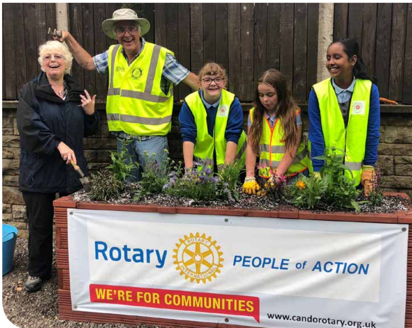
Children from St Andrew's school filling the planters