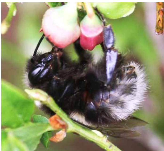
Heath Bumblebee