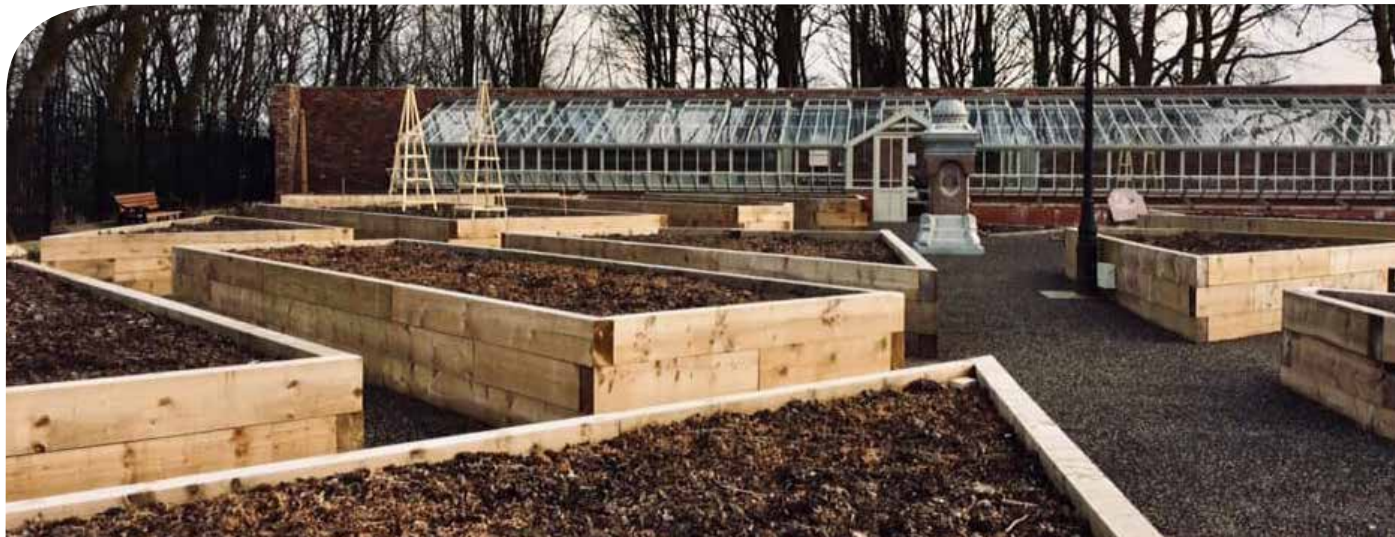
Raised beds at Rhyddings Park