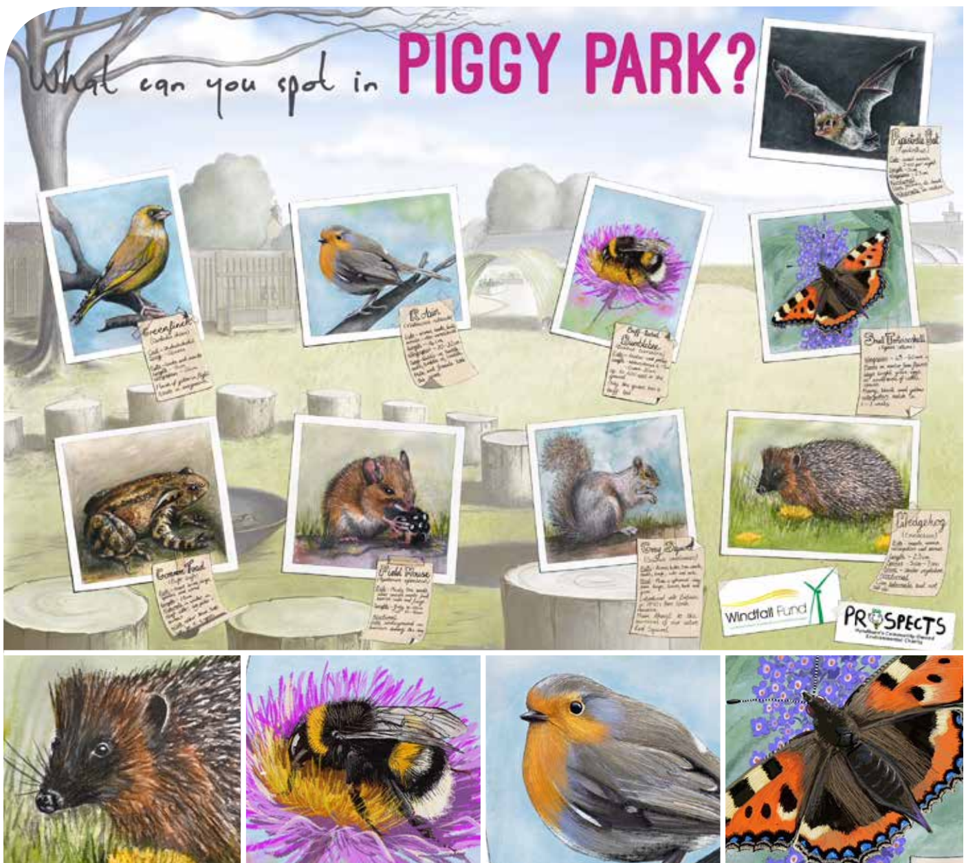
Interpretation panel at Piggy Park in Rishton and close up detail by local artist Ursula Hurst