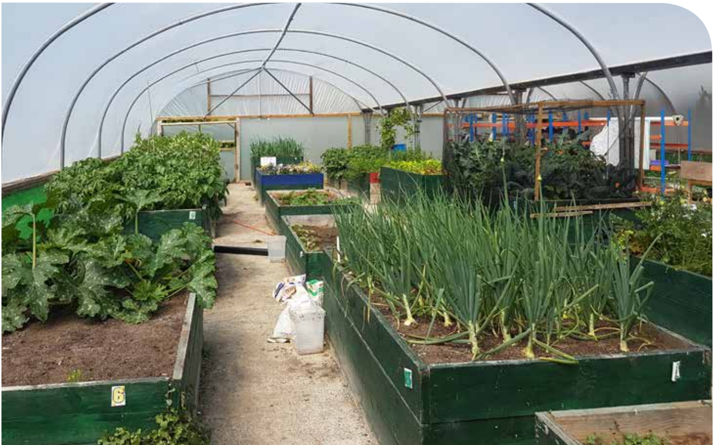
Refurbished polytunnel at Gatty Park