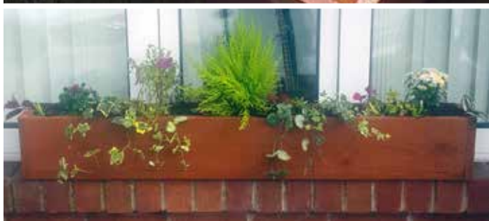
Hedgehog house, wooden bench and window box made by Sandy Lane Gardening Group volunteers

Since October 2014 when the Mini Grants were first introduced 26 grants have been awarded to a value of £5,588. They have proved very popular as they are easy to apply for, the decision time is very quick and there are only basic monitoring requirements. Groups can apply again when the grant has been spent but usually not for the same thing. Other projects funded in the past have included – outdoor clothing for Red Rose Recovery volunteers; cottage border plants for insects and bees at Churchfield House, Great Harwood; organic food growing training for St James' Project in Accrington; creation of a butterfly garden at Broadfield Specialist School in Oswaldtwistle; installation of a gate across a public footpath off Altham Lane in Huncoat; and a bog garden at Gatty Park in Church.