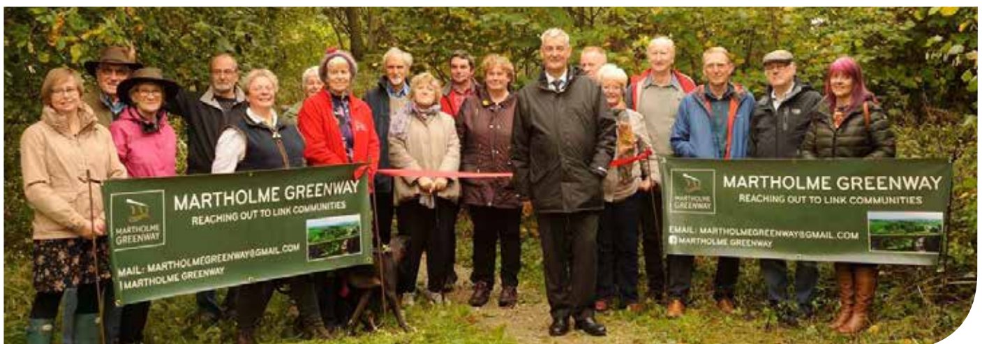
Official opening of Martholme Greenway by Graham Jones MP

14 different groups/organisations were funded offering a total of £62,578 which ranged from £202 to £20,572. The range of projects included a new boiler in a community building, meadow creation, the repair of a polytunnel, tree planting, bee surveys, purchase of wood for planters & habitat boxes, development of a community garden and even a wind turbine!