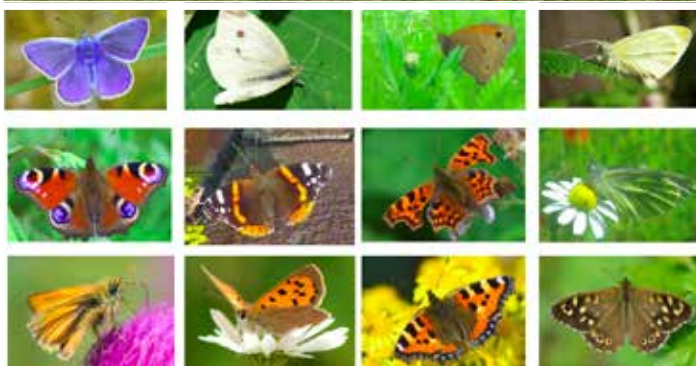
Development of wildflower meadow at Milnshaw Park and butterflies recorded